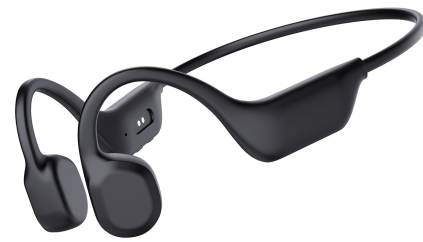
使用指南及保修说明 Operating instructions and Warranty description